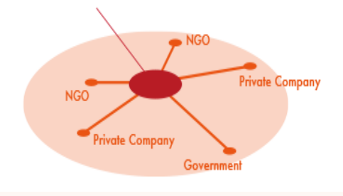
ASIA PACIFIC ALLIANCE : NATIONAL PLATFORM